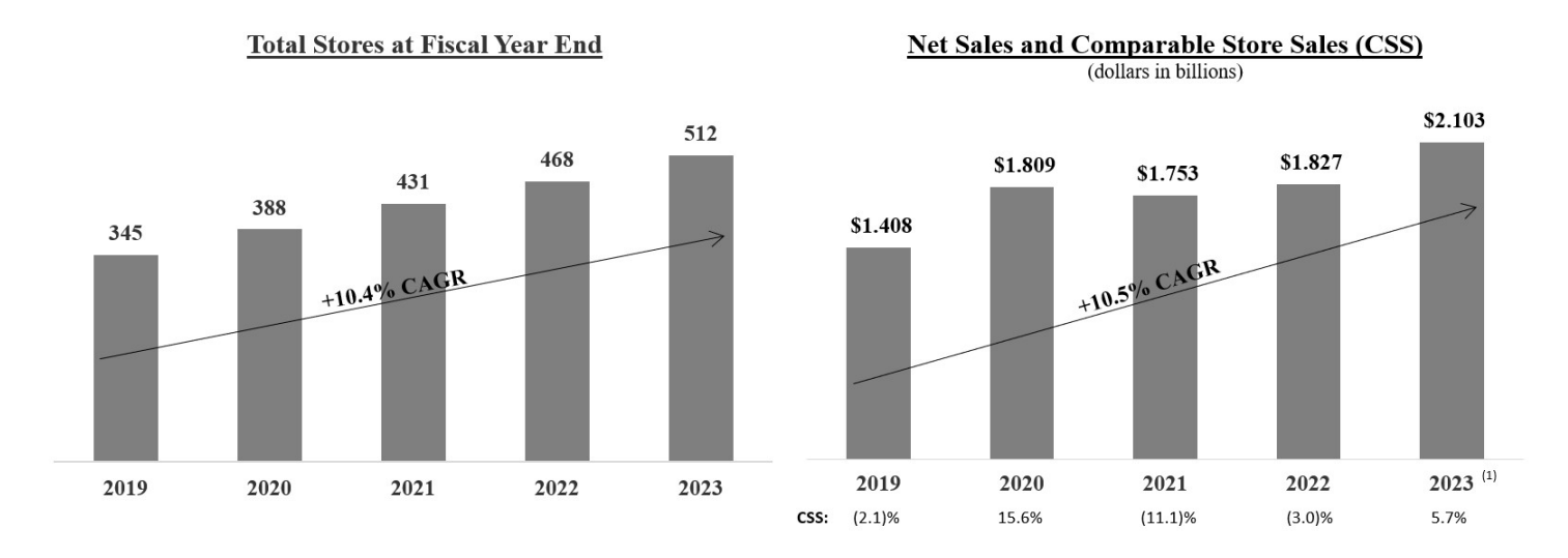
(1) 2023 consisted of 53 weeks compared with 52 weeks in the prior-year periods.